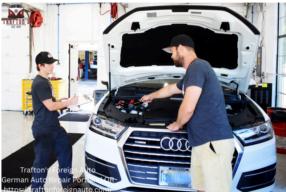
Trafton's Foreign Auto German Auto Repair Portland, OR https://traftonforeignauto.com/

Not each damaged engine must be rebuilt. This is the edge many drivers do not wish to hear, however it truly is in which terrific judgment topics such a lot.